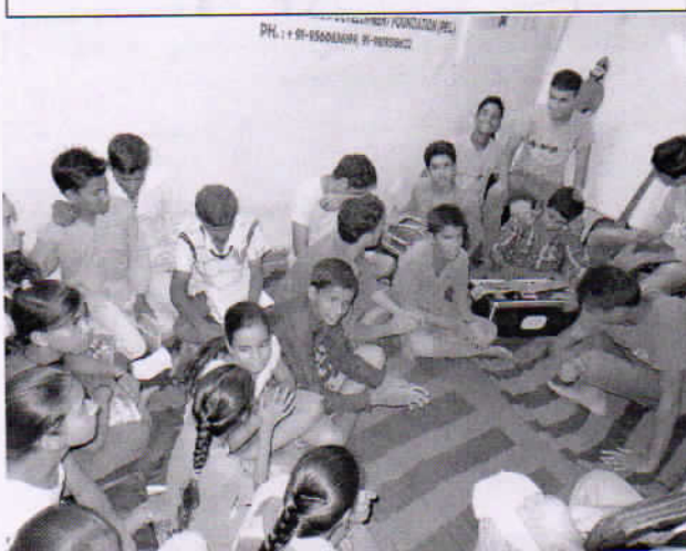
A singing competition organised in the month of September 2014