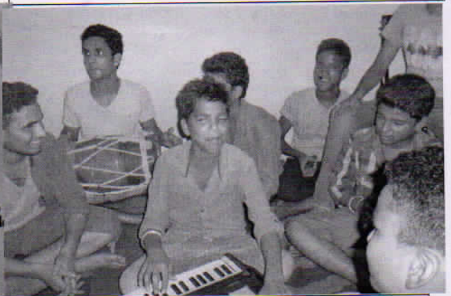
A singing competition organised in the month of September 2014