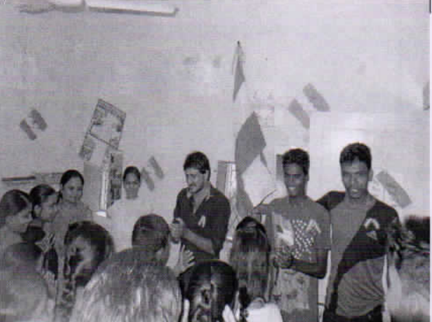
Celebration of Independence day – President with Member and teacher in our Free Coaching Centre

[Handwritten Signature] PRESIDENT MAURICETTE CHILD EDUCATION DEVELOPMENT FOUNDATION