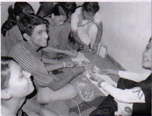
Celebration of Independence day – in our Free Coaching Centre