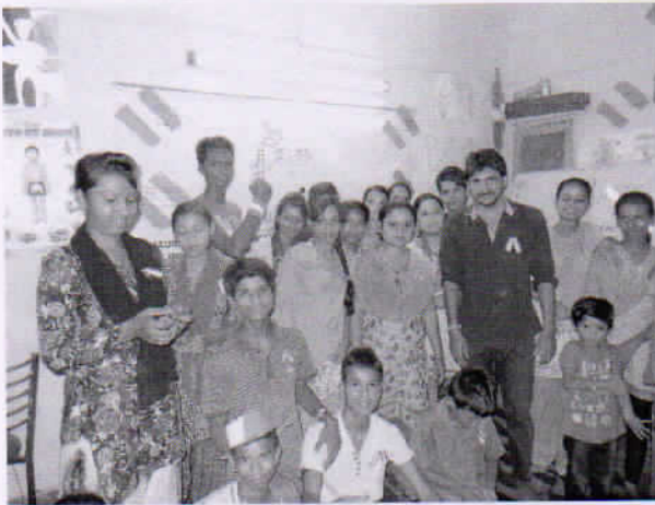
Celebration of Independence day – President with teacher in our Free Coaching Centre