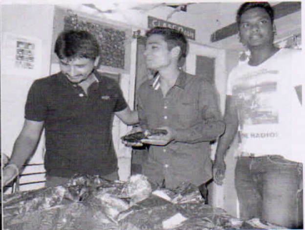
Celebration of Diwali in NGO-President with Secretary, distributing small gifts to children on the occasion of Diwali