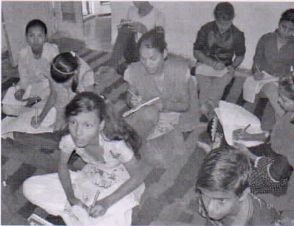
Classroom of Free Coaching Centre - Mauricette Child Education Development Foundation