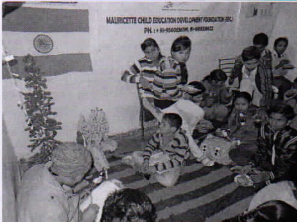
Celebration of X-Mas – in our Free Coaching Centre