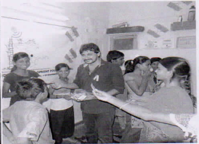
Celebration of Independence day – President with children in our Free Coaching Centre