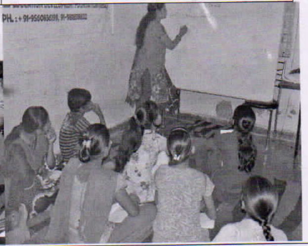
Classroom of Free Coaching Centre - Mauricette Child Education Development Foundation