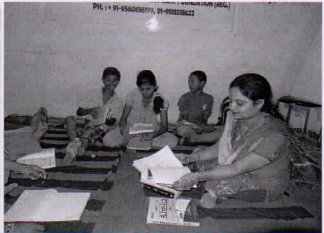
Distributing some study material in Free Coaching Centre - Mauricette Child Education Development Foundation