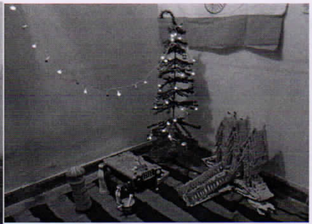
Celebration of X-Mas