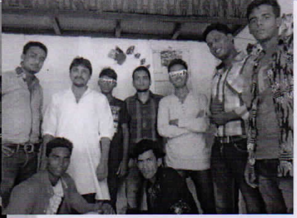
Celebration of Eid – Present and Secretary were invited by Muslim students