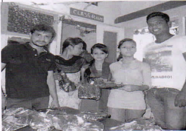
Celebration of Diwali in NGO-President with Secretary, distributing small gifts to children on the occasion of Diwali