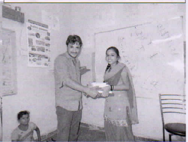
Distribution of school books set in Free Coaching Centre - Mauricette Child Education Development Foundation

Mauricette Child Education Development Foundation (Reg.)