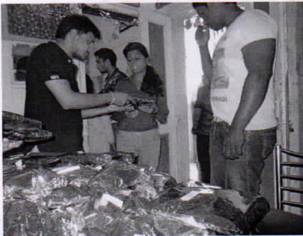
Celebration of Diwali in NGO-President with Secretary, distributing small gifts to children on the occasion of Diwali