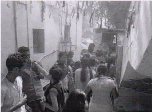
Celebration of Diwali