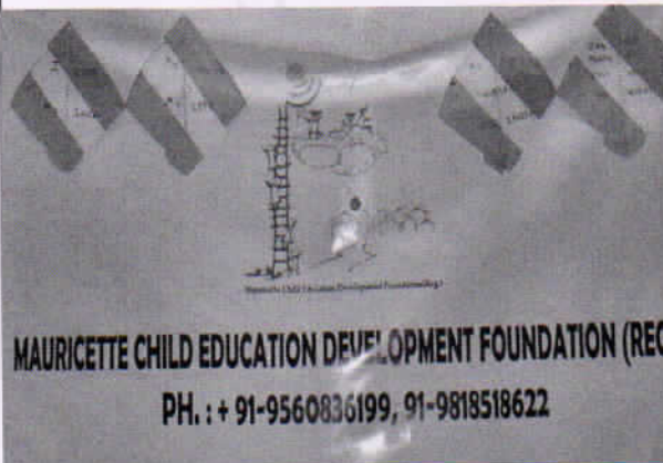
Celebration of Independence day – in our Free Coaching Centre