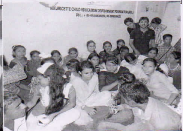
Celebration of Diwali in NGO-President with students