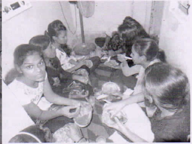
Celebration of Diwali – Free Coaching Centre, Mauricette Child Education Development Foundation