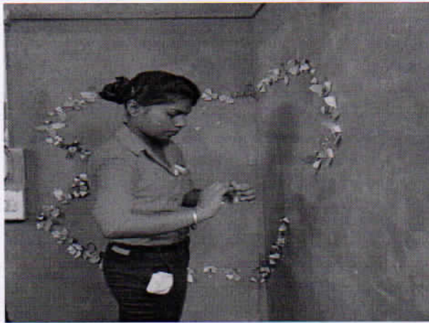
A girl from Ngo showing a phenomenal "paper art work" on the occasion of a competition organised on Independence day