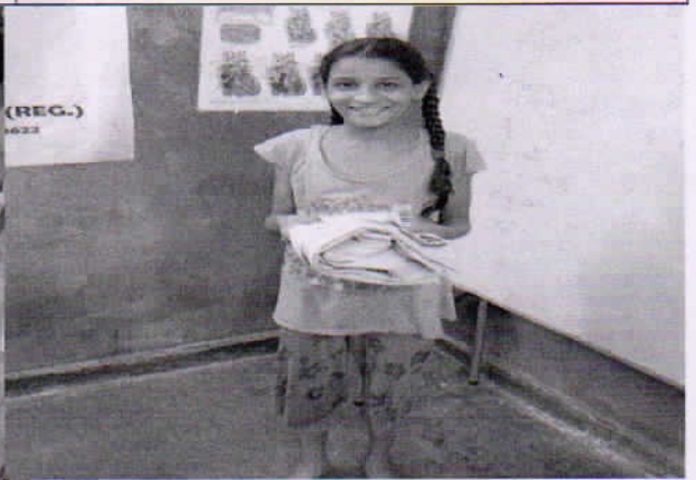
Distribution of school uniform - Free Coaching Centre, Mauricette Child Education Development Foundation