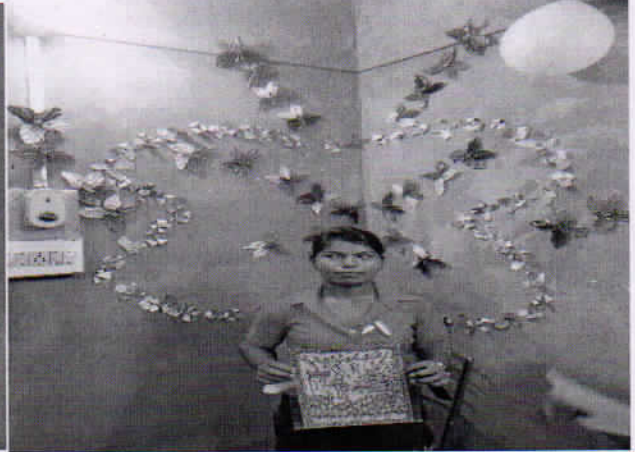
Girl with her two artistic works: a painting that she is carrying & paper work over the wall behind her on Independence day - Free Coaching Centre