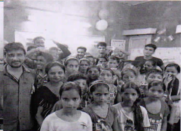
Celebration of Independence day – President with teacher in Free Coaching Centre, Mauricette Child Education Development Foundation