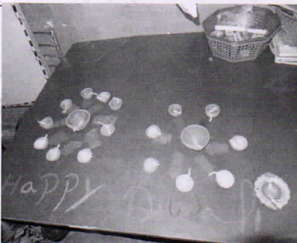
Celebration of Diwali – Free Coaching Centre, Mauricette Child Education Development Foundation