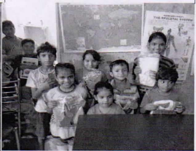
School Uniform distribution of two private schools - in Free Coaching Centre, Mauricette Child Education Development Foundation

PRESIDENT MAURICETTE CHILD EDUCATION DEVELOPMENT FOUNDATION