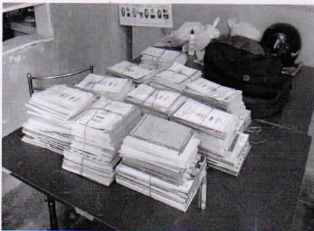
School Book set distribution in Free Coaching Centre, -Mauricette Child Education Development Foundation