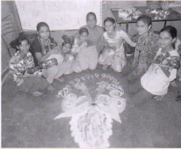
Celebration of Diwali – Free Coaching Centre, Mauricette Child Education Development Foundation