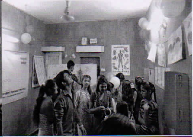
Celebration of Independence day in Free Coaching Centre