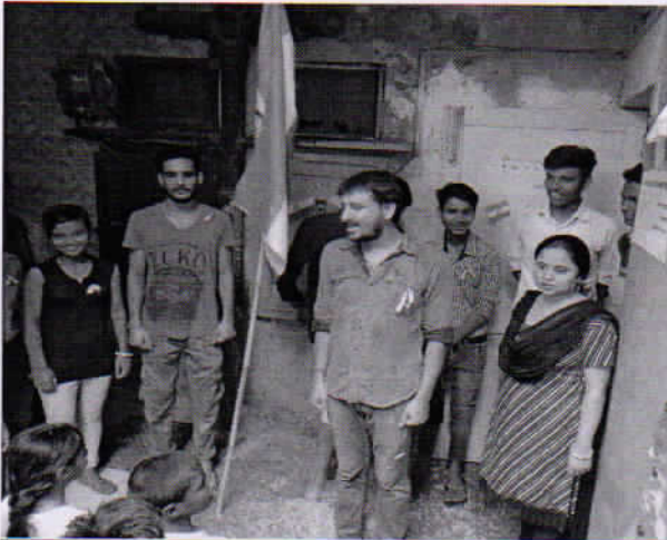
Celebration of Independence day – President of ngo raised the National flag with chants of National Anthem in Free Coaching Centre