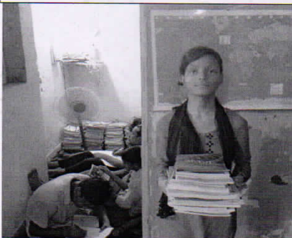
School Book set distribution in Free Coaching Centre, -Mauricette Child Education Development Foundation