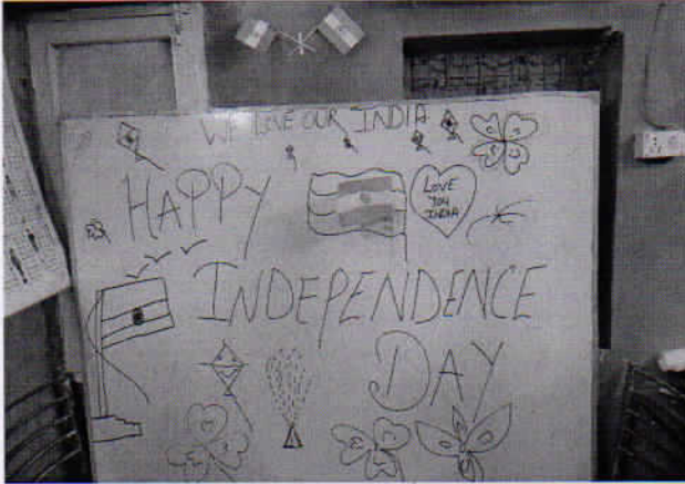
Celebration of Independence day in Free Coaching Centre