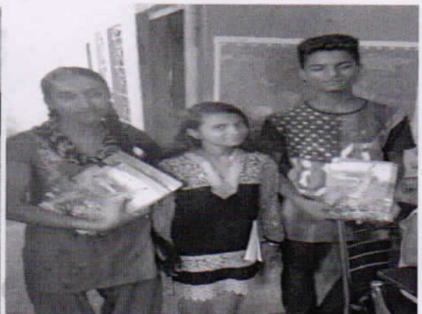
School Book set distribution in Free Coaching Centre, -Mauricette Child Education Development Foundation