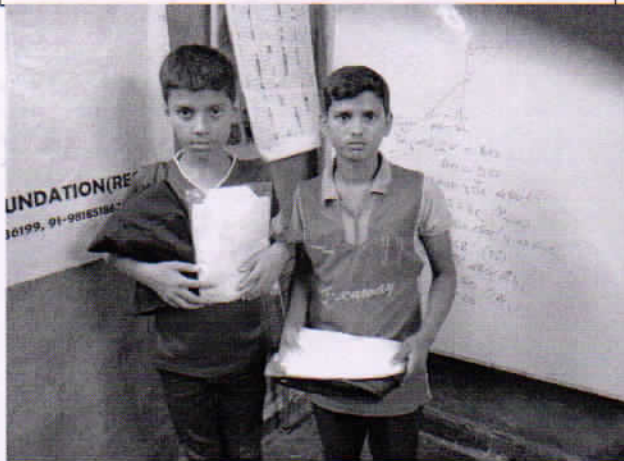
Distribution of school uniform - Free Coaching Centre, Mauricette Child Education Development Foundation