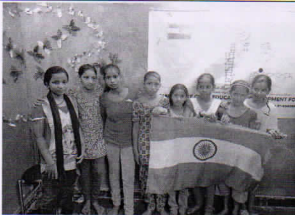
Celebration of Independence day – Free Coaching Centre, Mauricette Child Education Development Foundation