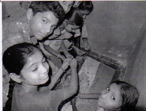
Celebration of Independence day - Children doing decoration in Free Coaching Centre