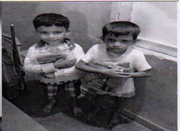
Distribution of school uniform - Free Coaching Centre, Mauricette Child Education Development Foundation

PRESIDENT MAURICETTE CHILD EDUCATION DEVELOPMENT FOUNDATION