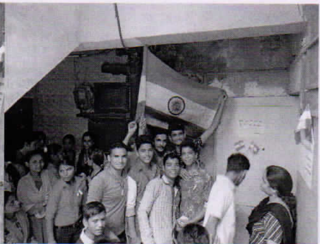
Celebration of Independence day