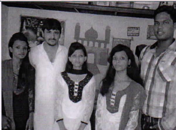
Celebration of Eid – President and Secretary participating in eid celebration with Muslim families of children