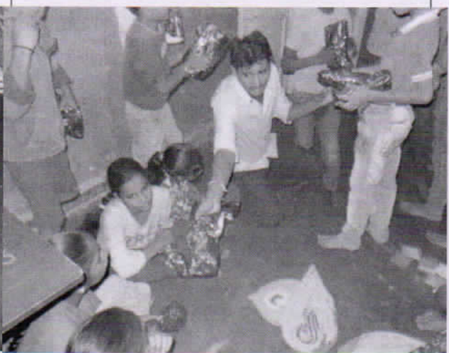
Celebration of Diwali – President distributing small gifts to the children in Free Coaching Centre, Mauricette Child Education Development Foundation

PRESIDENT MAURICETTE CHILD EDUCATION DEVELOPMENT FOUNDATION